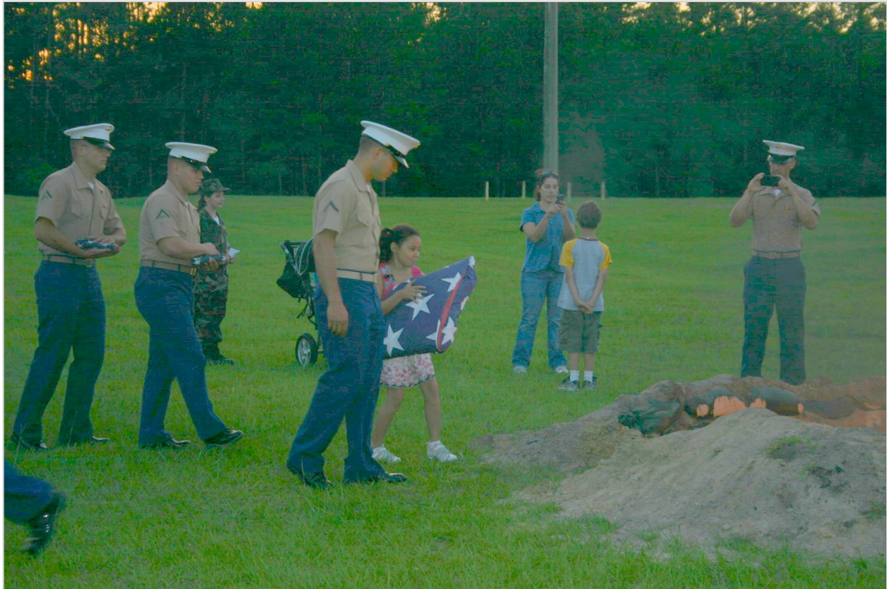
Unknown little girl accomplishes a big mission.